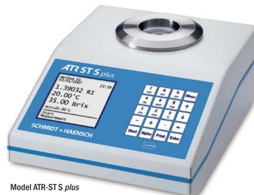
Model ATR-ST S plus