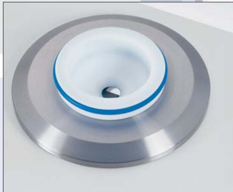
Teflon® Prism Well Insert