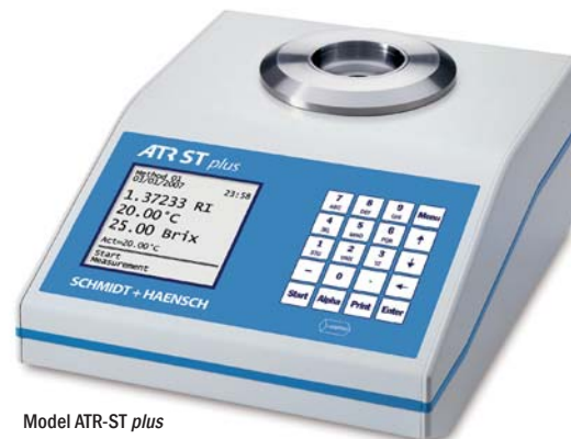
Model ATR-ST plus