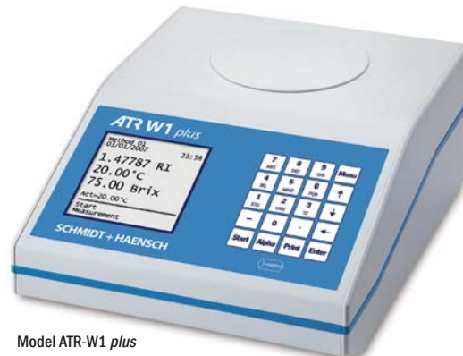
Model ATR-W1 plus