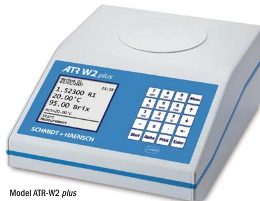
Model ATR-W2 plus