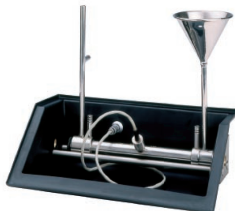
Flow-through tube with T-sensor

To measure unclarified samples , SCHMIDT+HAENSCH recommends the system AutoFilt ®. This semi automatic filtration system filtrates an industrial sugar solution to a turbidity-free state within 30 sec. maximum.