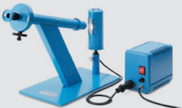
Visual circle polarimeter