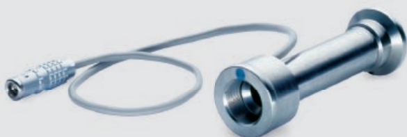
Quartz control plate with integrated temperature sensor